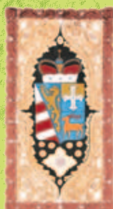
Austrian Coast (Gorica - Grado, Istria)