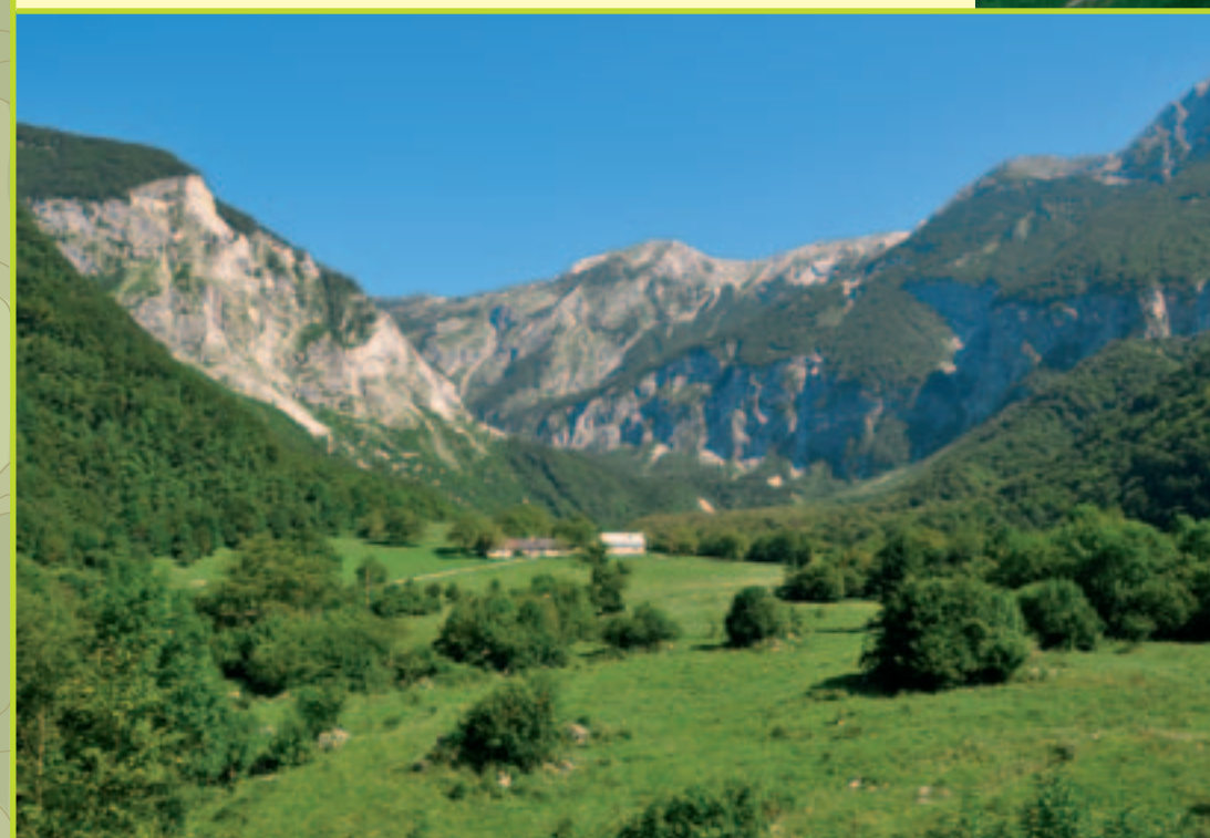
Polog Alpine pasture

The Church of the Holy Spirit has for many decades PROCLAIMED PEACE. It is noteworthy that still today, in addition to the main Catholic mass on Whit Sunday in May, it also celebrates the Orthodox mass on St. Vitus's Day. At one time, while war was raging around it, soldiers of various creeds took refuge inside, and for at least a moment they were able to forget here the horrors of war, while today it is visited by PEOPLE FROM ALL OVER THE WORLD.