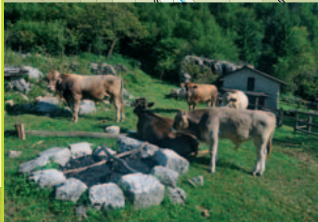
Prode Alpine pasture