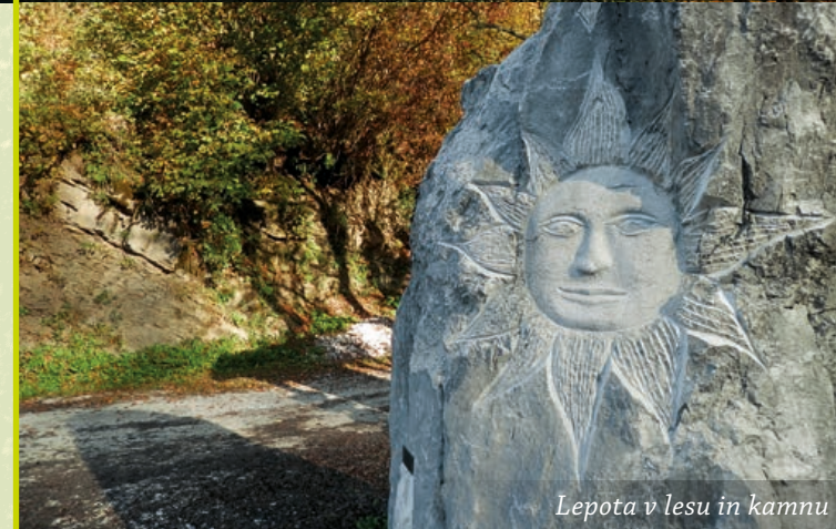
Lepota v lesu in kamnu

Besides the prominent CHURCH OF THE SACRED HEART OF JESUS in Drežnica, built just before the First World War, there is yet another sacral monument worth seeing in the area, namely the CHURCH OF ST. JUST in Koseč with interesting frescoes built in 13th century. The permanently open PRIVATE COLLECTION BOTOGNICE displays the horrors of First World War. Art lovers are recommended a stroll from Drežnica to Koseč where the works of art workshops with the title "Lepota v lesu in kamnu" (Beauty in Wood and Stone) are displayed along the trail.