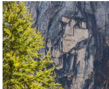
Ajdovska deklica.